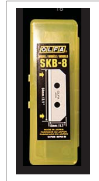
Tube of 10